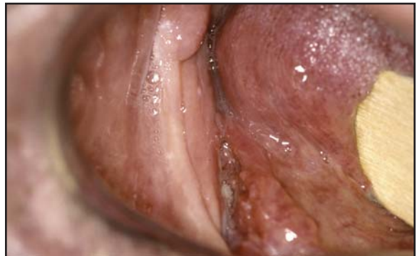
Squamous cell carcinoma Ulceration on floor of mouth in edentulous patient, initially misinterpreted as denture irritation.