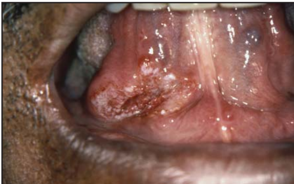
Squamous cell carcinoma Ulceration with surrounding leukoplakia in a 63-year-old male with a history of tobacco and alcohol abuse.