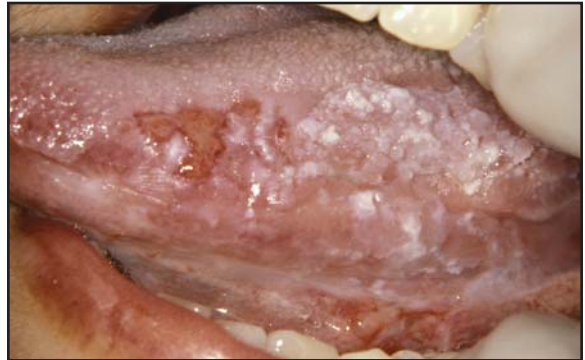
Squamous cell carcinoma Mixed erythroplakia-leukoplakia in a female with a history of tobacco use.