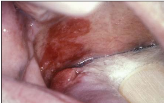
Squamous cell carcinoma

Asymptomatic erythroplakia-leukoplakia in a 45-year old female with a history of tobacco and alcohol abuse.