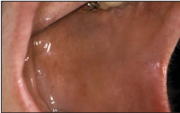
Normal buccal mucosa

Asymptomatic, pebbly erythroplakia-leukoplakia with ulceration. Lesions with this appearance are commonly misinterpreted as a fungus infection.