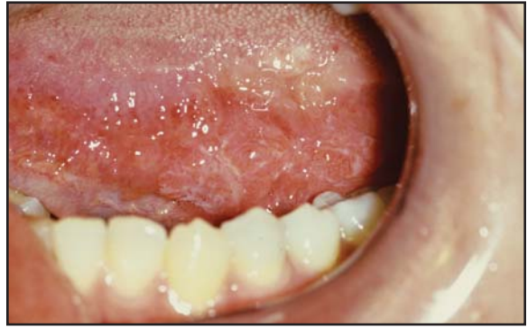
Carcinoma-in-situ Subtle clinical leukoplakia in a 31-year-old female with no risk factors for squamous cell carcinoma.