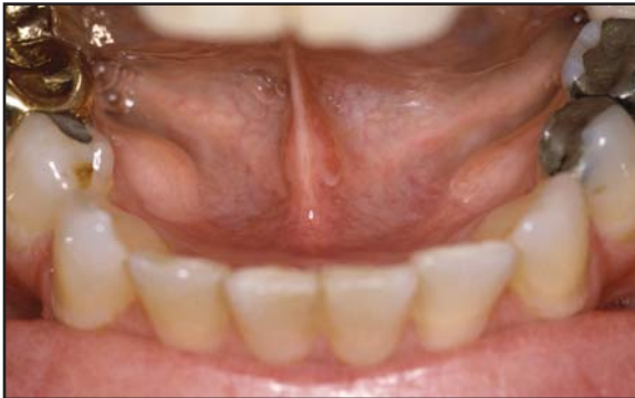
Normal floor of mouth with bilateral mandibular tori (exostoses)