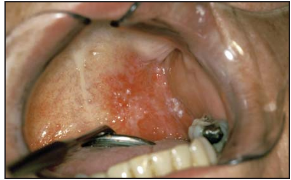
Squamous cell carcinoma

Asymptomatic erythroplakia-leukoplakia in a 45-year old female with a history of tobacco and alcohol abuse.