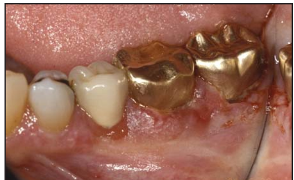
Squamous cell carcinoma

Mixed erythroplakia-leukoplakia erroneously treated as lichen planus prior to biopsy.