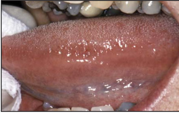
Normal lateral tongue Correct technique for visualization of lateral tongue.