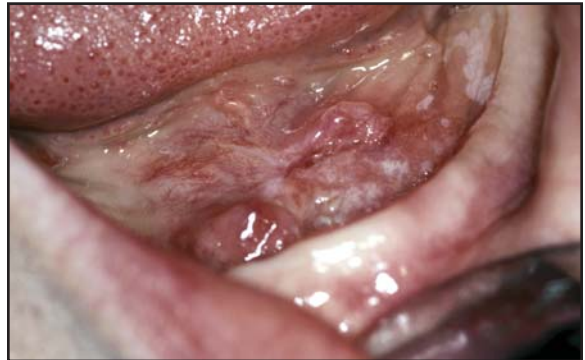
Squamous cell carcinoma Mixed asymptomatic erythroplakia-leukoplakia in a 55-year-old female with history of tobacco and alcohol abuse.