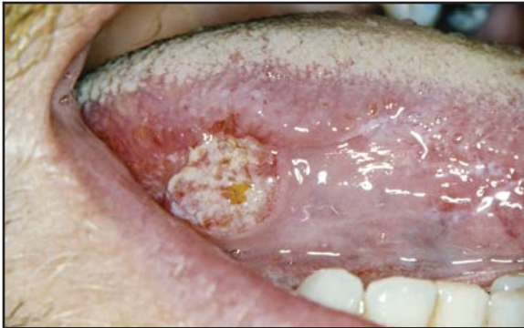
Squamous cell carcinoma Persistent asymptomatic ulceration in a 32-year-old male with no risk factors for squamous cell carcinoma.