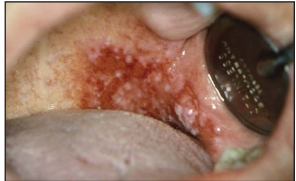
Squamous cell carcinoma

Erythroplakic lesion of palate and posterior lateral tongue discovered on routine dental exam in a 60-year-old male with history of tobacco use.