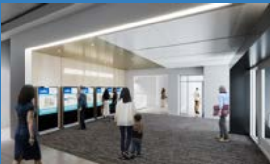
SUBJECT TO CHANGE.