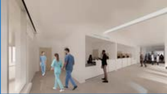
SUBJECT TO CHANGE.