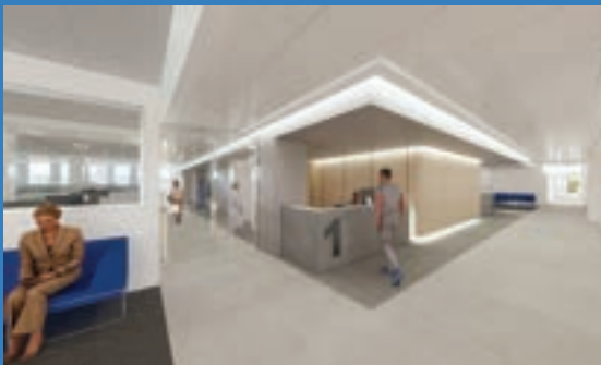
SUBJECT TO CHANGE.