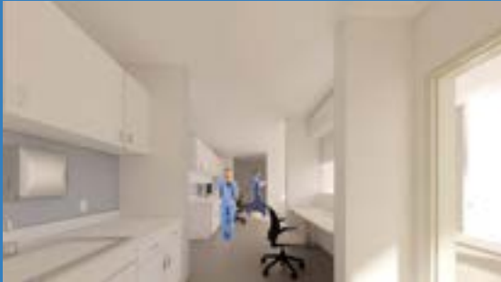
SUBJECT TO CHANGE.