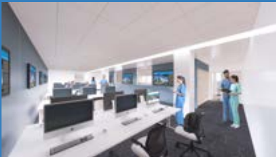
SUBJECT TO CHANGE.