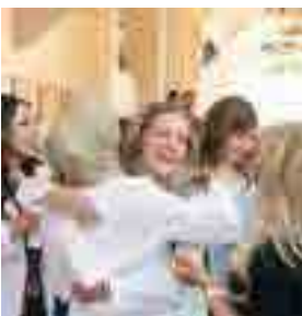
Transition Ceremony page 16