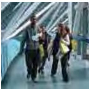
Midwest Dental Conference page 7