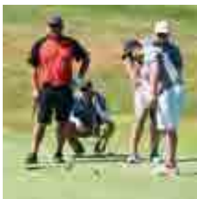
A Fantastic Day "Fore" Golf page 11