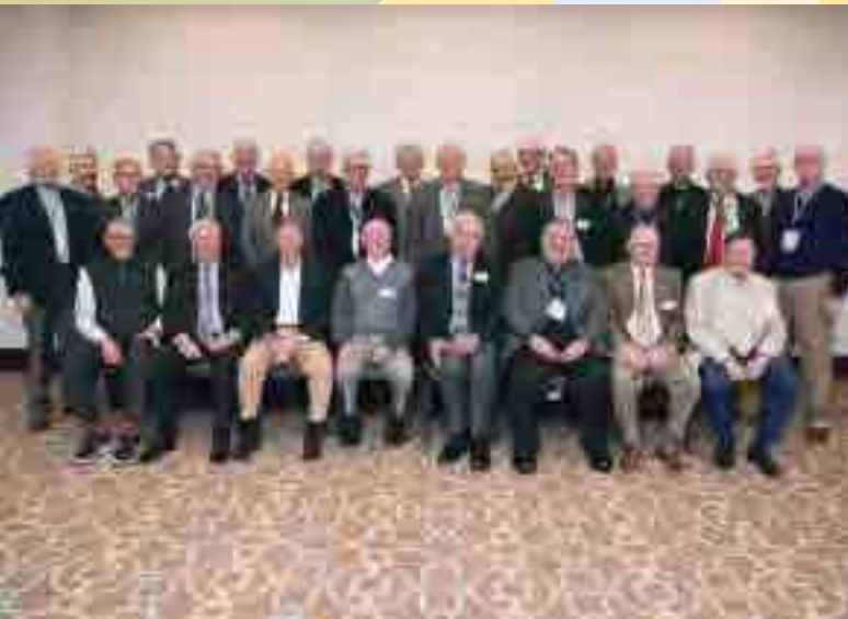
Class of 1968 reunion attendees

It was such a treat to see a large turnout of the Class of 1968 at the Rinehart Foundation Recognition breakfast on Saturday morning. With a whopping 28 members and their guests in attendance, it was a room full of great stories and memories! Also honored at the breakfast were alumni who have made significant gifts to the foundation with $10,000+ lifetime giving, $25,000+ lifetime giving, $50,000+ lifetime giving, and $100,000+ lifetime giving.