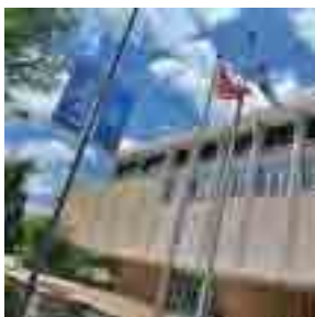
New Faculty page 15