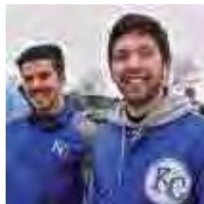
A "Royals" Beginning to the Semester page 11