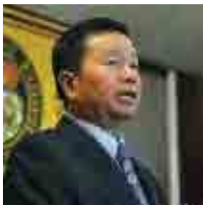
New Leadership page 3