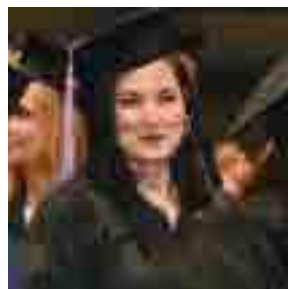
Graduation page 21